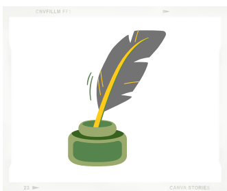
SILVER QUILL $2,500