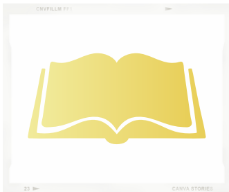
GOLDEN BOOK $5,000